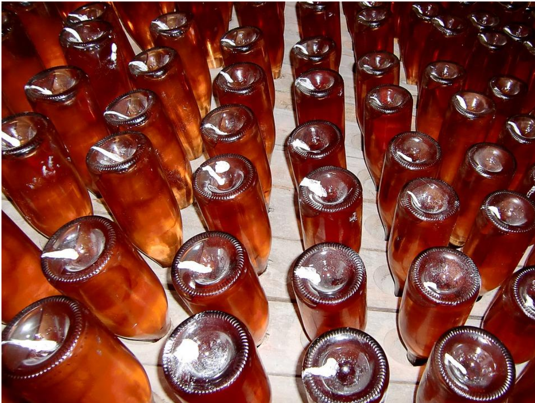
Cava - Barcelona

After that, you will visit one of the wineries of the Penedes cava where you can see the development of the famous cava.