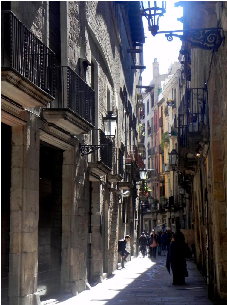
Gothic quarter - Barcelona