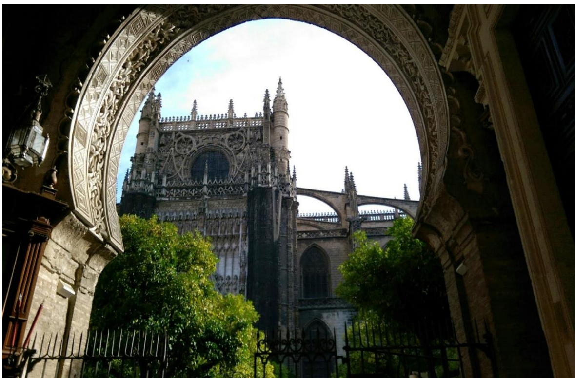
Cathedral of Seville