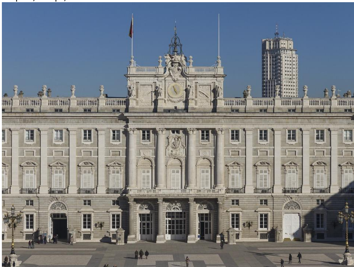
Royal palace – Madrid

The Royal Palace was built in the XVIII Century and it is considered one of the most important Royal Palaces of the world especially for its interior decoration rich in Carpets, Lamps, Clocks and Furniture.