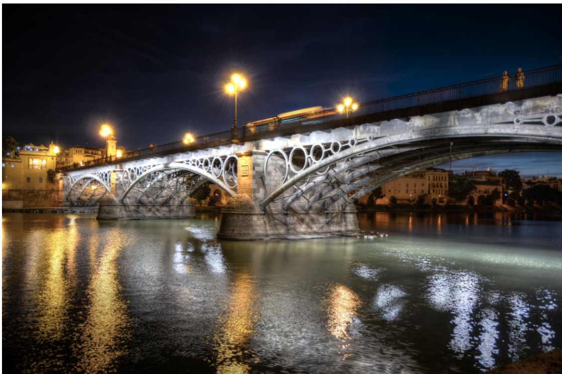
Triana bridge - Seville