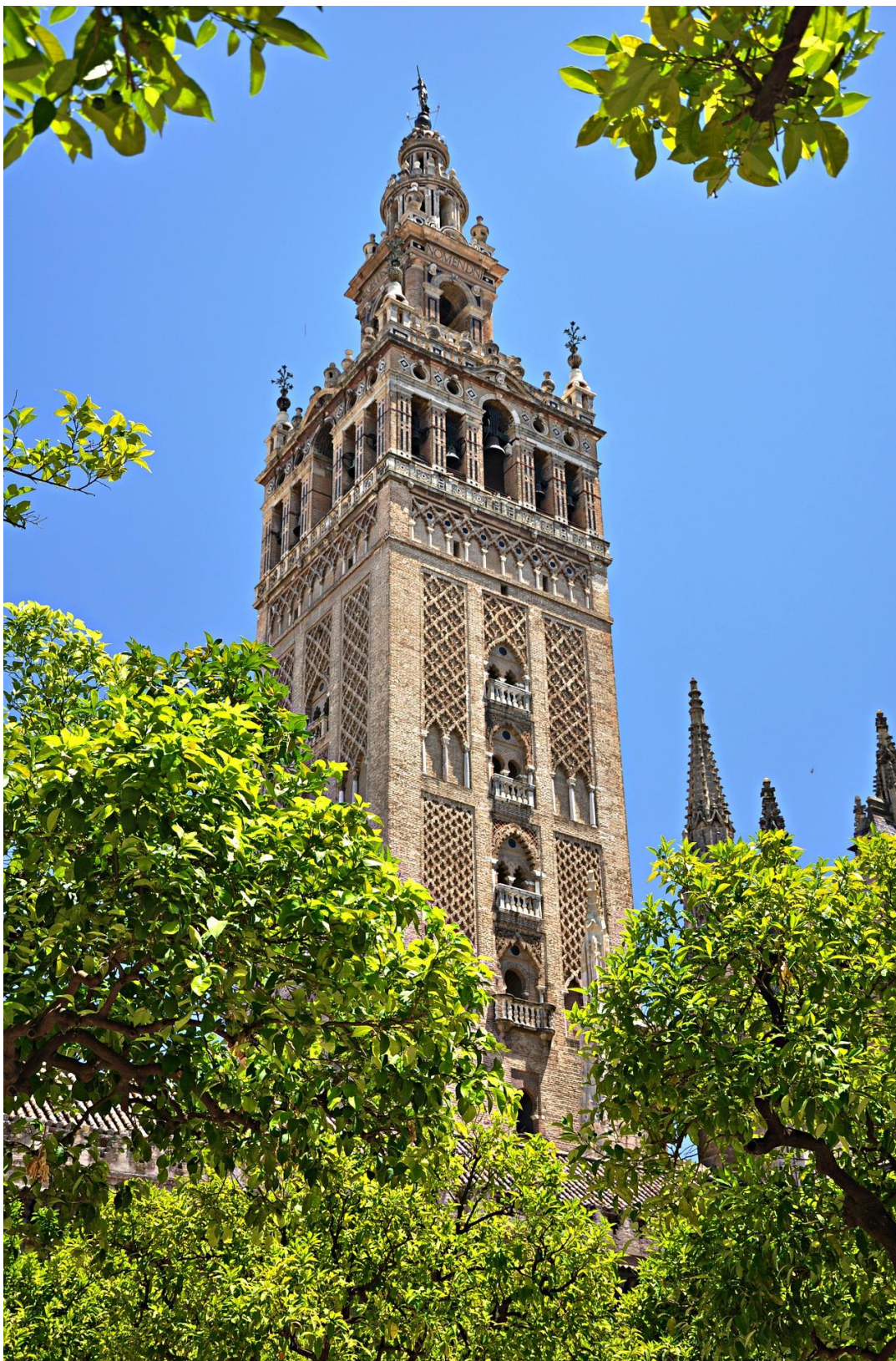
Giralda - Seville