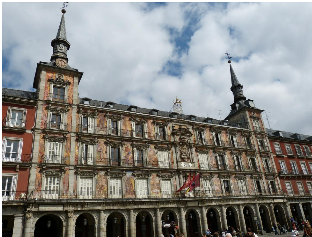
Plaza mayor - Madrid

You will make a tour of Plaza de Oriente, Calle Bailen, , Calle Mayor, Plaza y Casa de la Villa, Casa de Cisneros, Torre de los Luajanes, Convento de Carboneras, Mercado de San Miguel and Plaza Mayor.