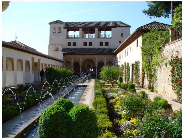
Alhambra gardens - Granada