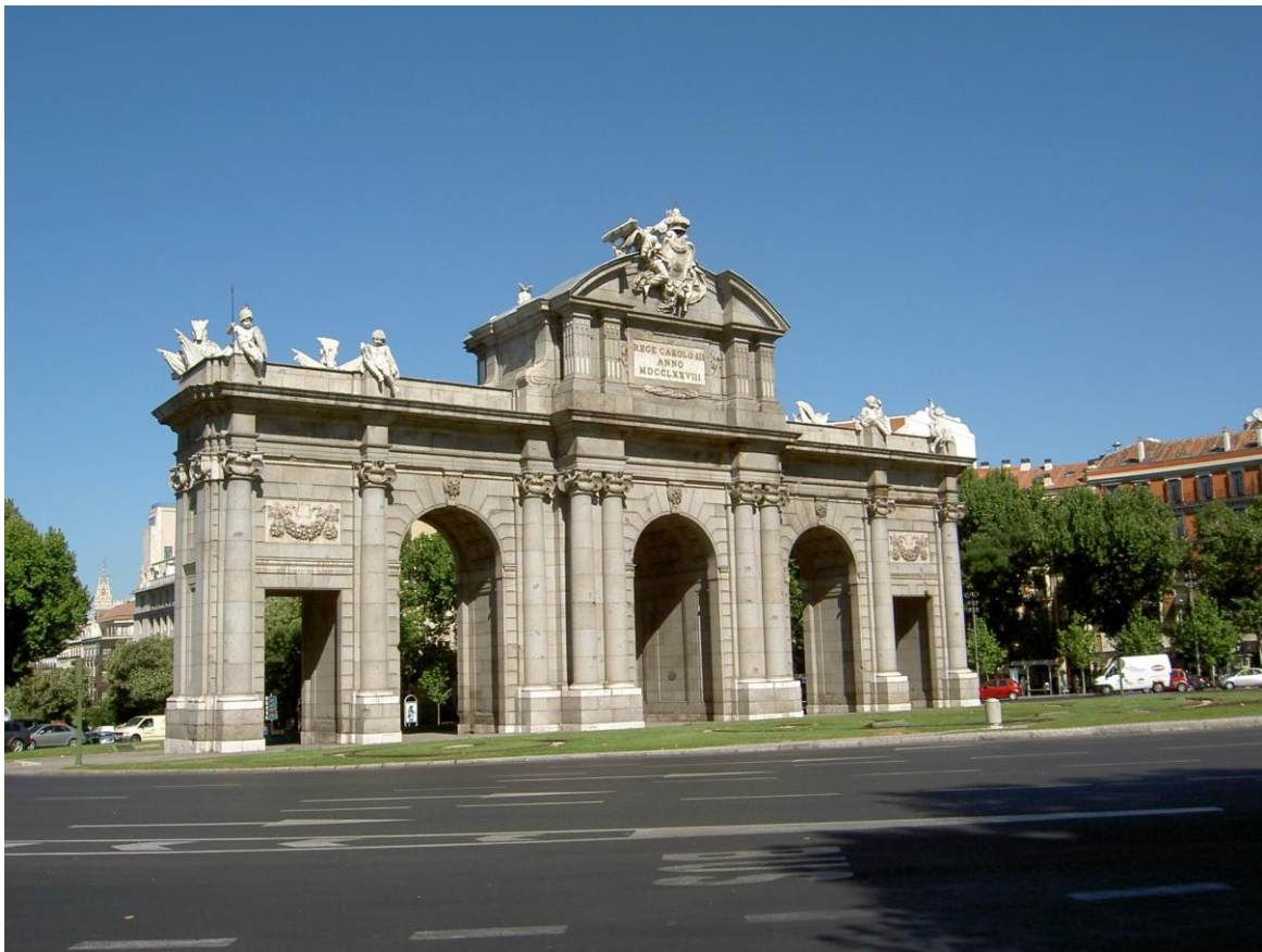
Alcala door - Madrid

You will make a tour of Plaza de Oriente, Calle Bailen, , Calle Mayor, Plaza y Casa de la Villa, Casa de Cisneros, Torre de los Luajanes, Convento de Carboneras, Mercado de San Miguel and Plaza Mayor.