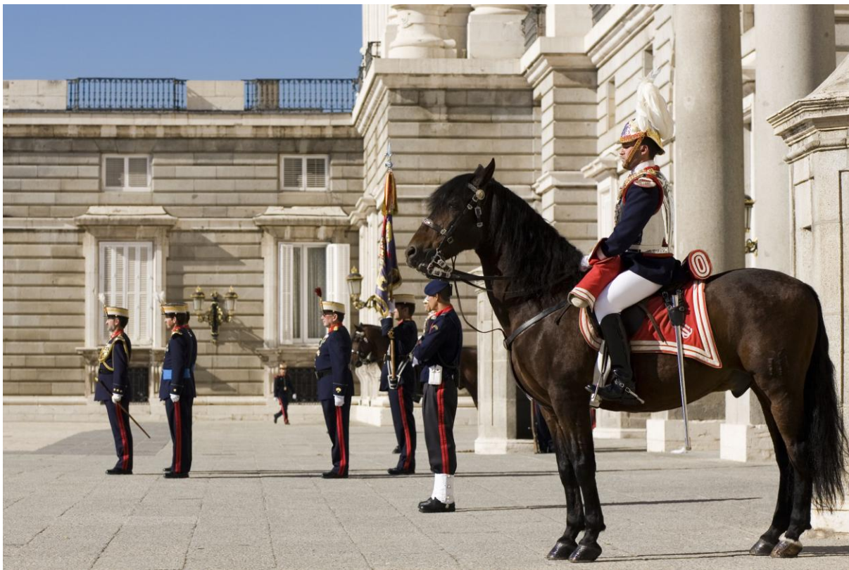
Royal Palace – Madrid

The Royal Palace was built in the XVIII Century and it is considered one of the most important Royal Palaces of the world especially for its interior decoration rich in Carpets, Lamps, Clocks and Furniture.