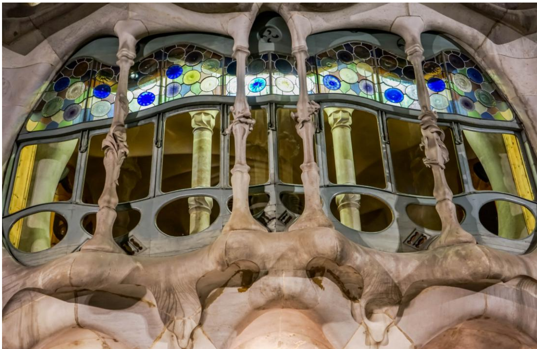
Gaudi house - Barcelona