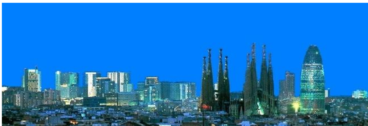
Panoramic of Barcelona city