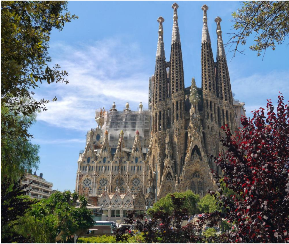
Sagrada Familia - Barcelona