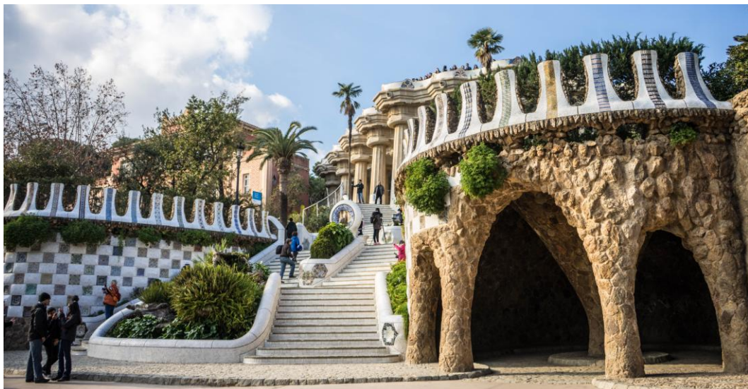
Guell park - Barcelona