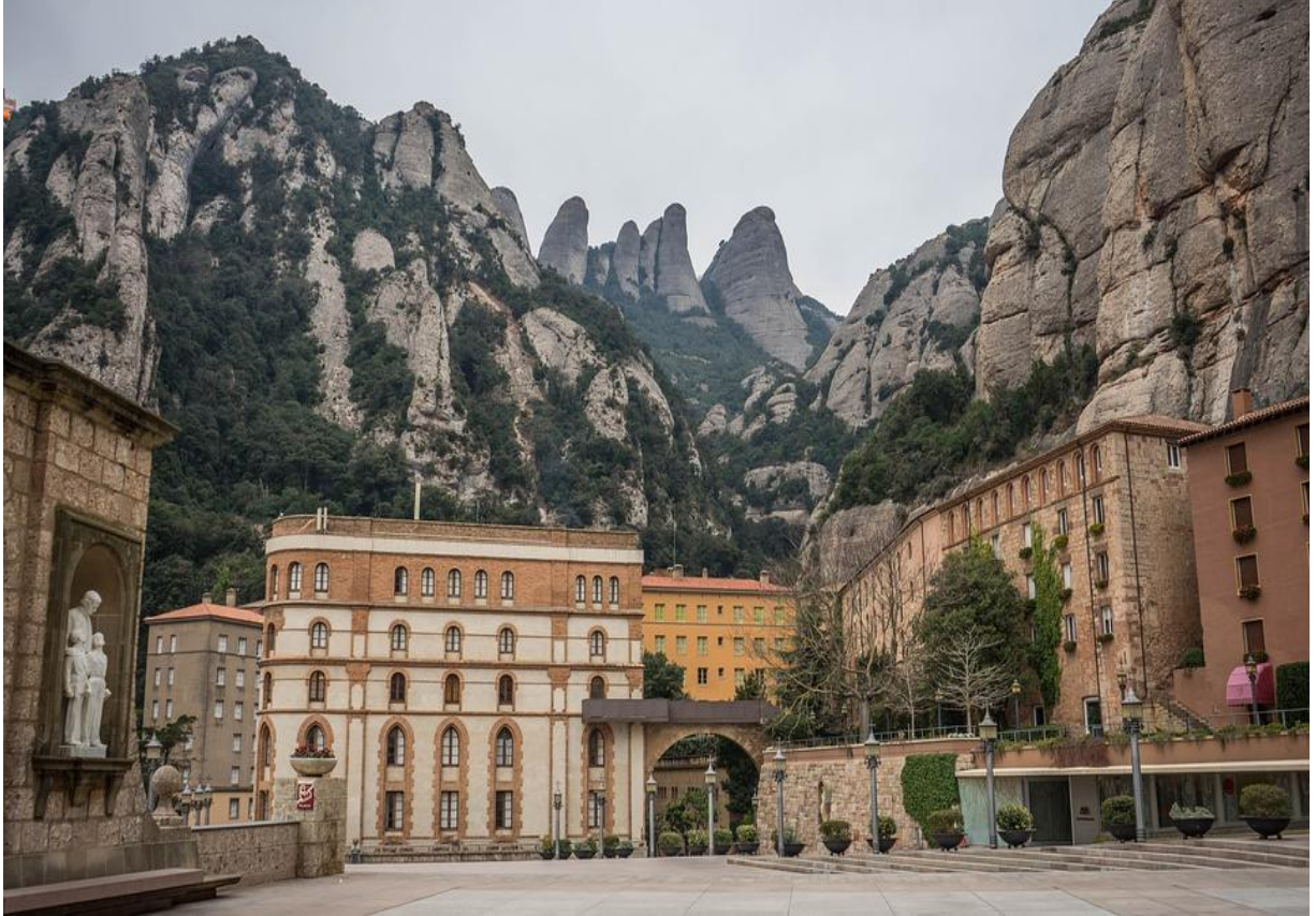
Monastery of Montserrat - Barcelona

In the morning you will continue with the visit of Barcelona.