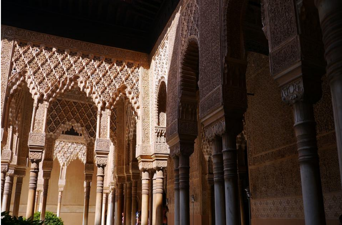
Alhambra - Granada

You will also have the opportunity to walk through two neighborhoods with more color, charm and history of the city of Granada, Albayzin (declared a World Heritage by UNESCO) and Sacromonte quarters. Led by our local guide you will go through a maze of narrow streets scented with jasmine, to reach the Mirador de San Nicolas, there one can admire the breathtaking views of the Alhambra, Granada and Sierra Nevada. Have a drink in a cave in the Sacromonte before returning to your hotel at the end of an unforgettable day.