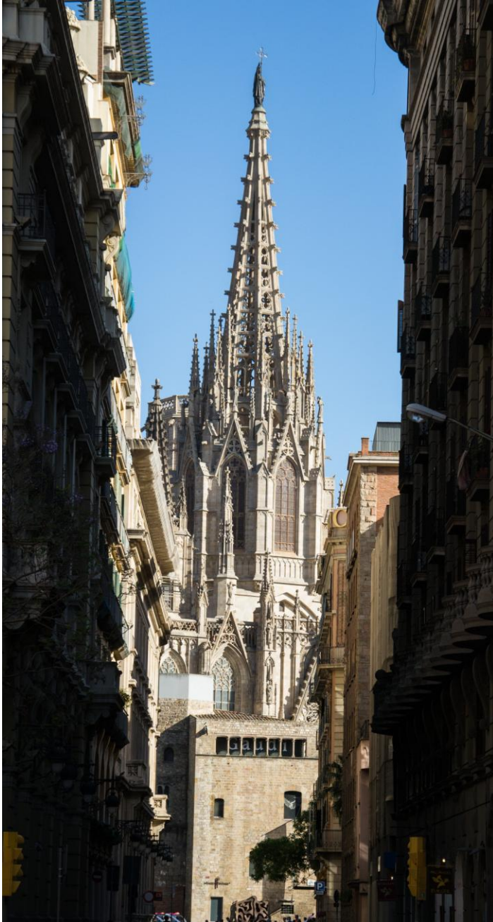
Cathedral of Barcelona