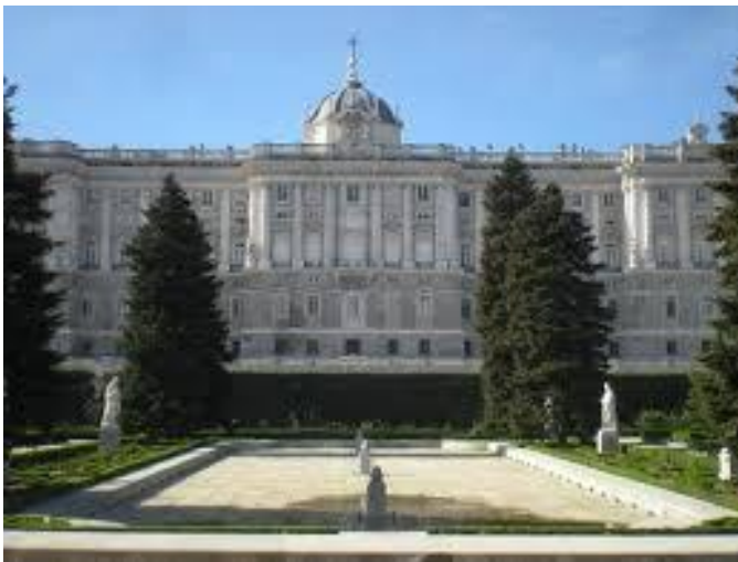
Royal palace - Madrid

The Royal Palace was built in the XVIII Century and it is considered one of the most important Royal Palaces of the world especially for its interior decoration rich in Carpets, Lamps, Clocks and Furniture.