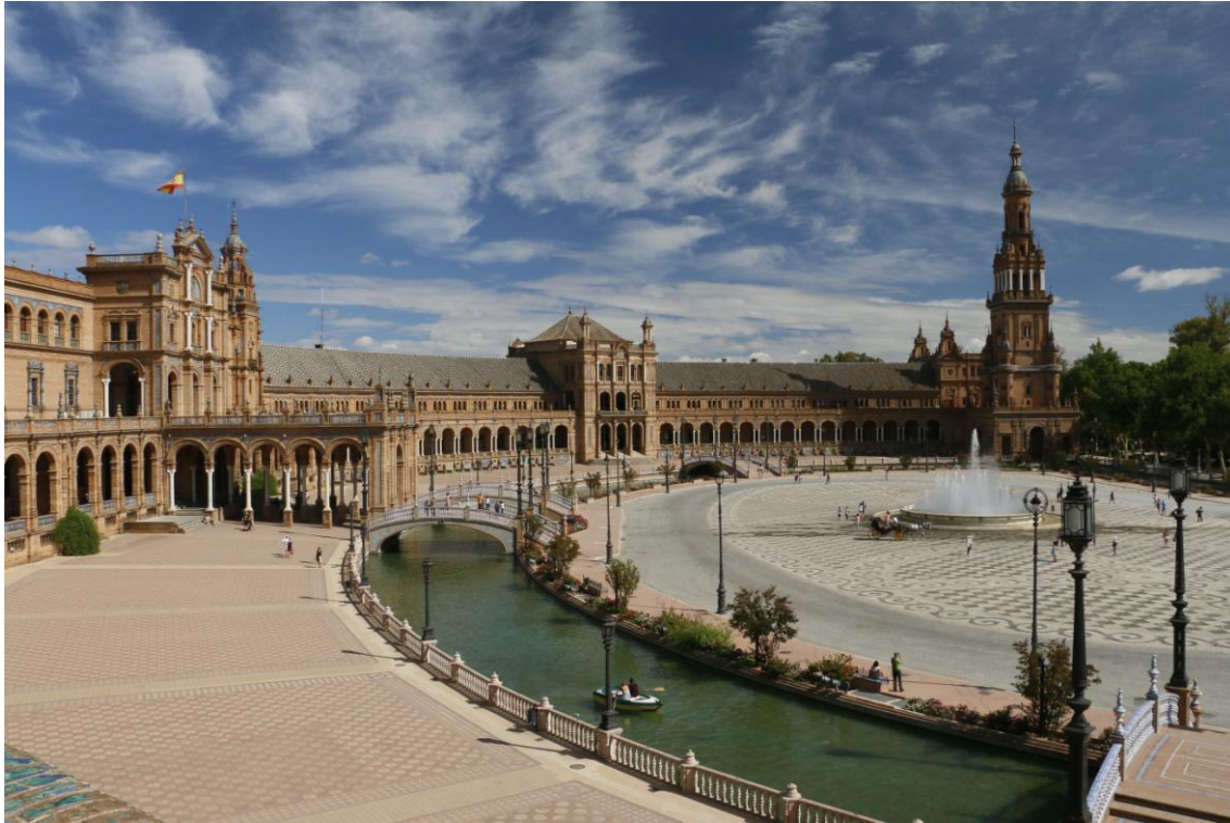
Spain square - Seville