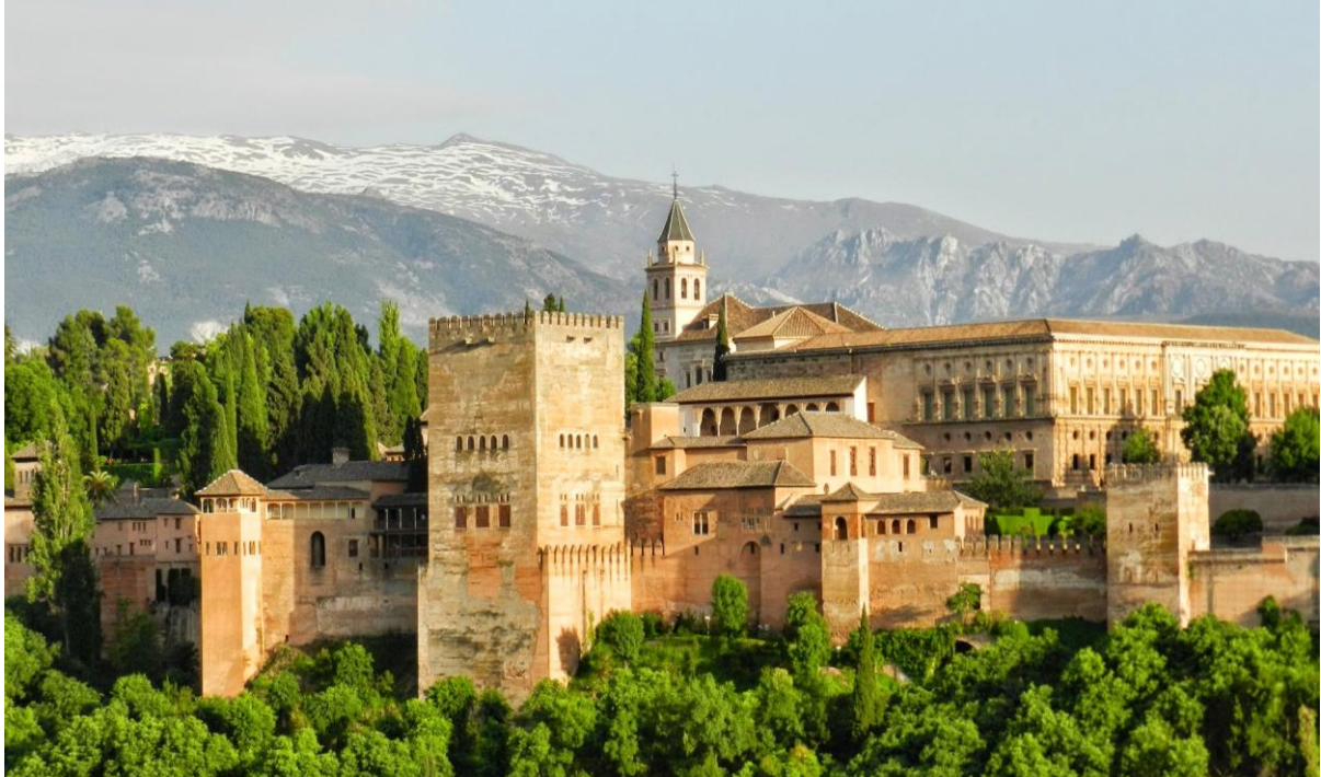
Alhambra - Granada

In the morning you will go by train to Granada. Journey time around 3 hours.