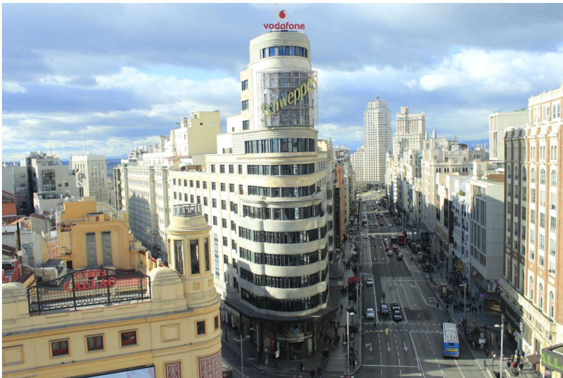
Gran via Street

You will make a tour of Plaza de Oriente, Calle Bailen, , Calle Mayor, Plaza y Casa de la Villa, Casa de Cisneros, Torre de los Luajanes, Convento de Carboneras, Mercado de San Miguel and Plaza Mayor.