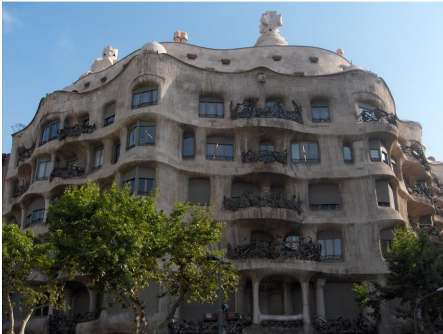
Gaudi house - Barcelona