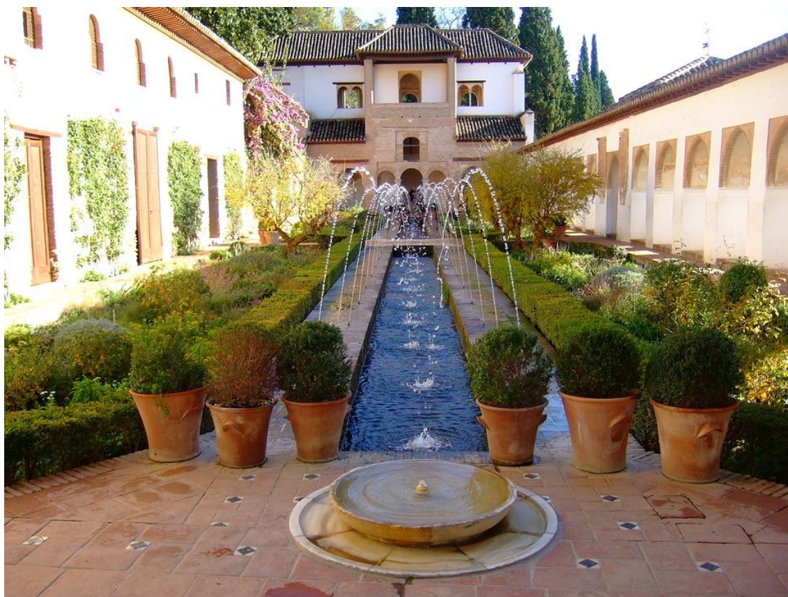
Generalife gardens – Alhambra - Granada

What we propose to you is to transform this visit in to an extraordinary experience rich of knowledge. With our guided tour of Alhambra, you'll have at your disposal one of our official tourist guides, expert interpreters of Granada's heritage, who will guide you through every part that forms the "red fortress", who will also answer any queries that you may have about this spectacular monument.