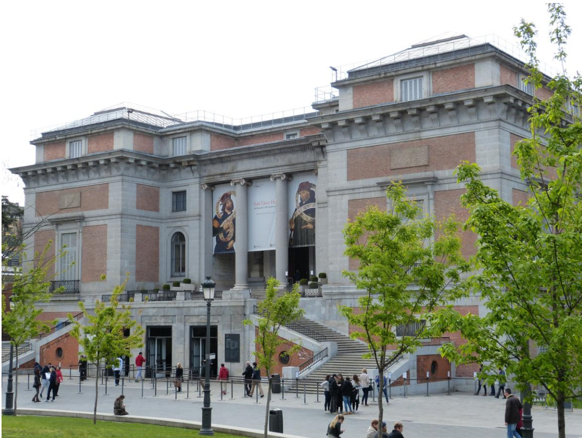
Prado museum - Madrid

During the evening visit the Prado Museum, one of the most important art galleries of the world. It hosts halls dedicated to the great masters of the Spanish School such as Goya, Velazquez, El Greco, Zurbaran, etc.