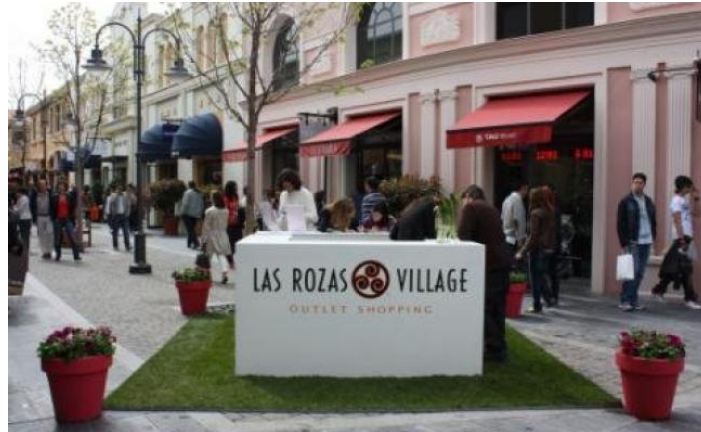
Shopping - Madrid